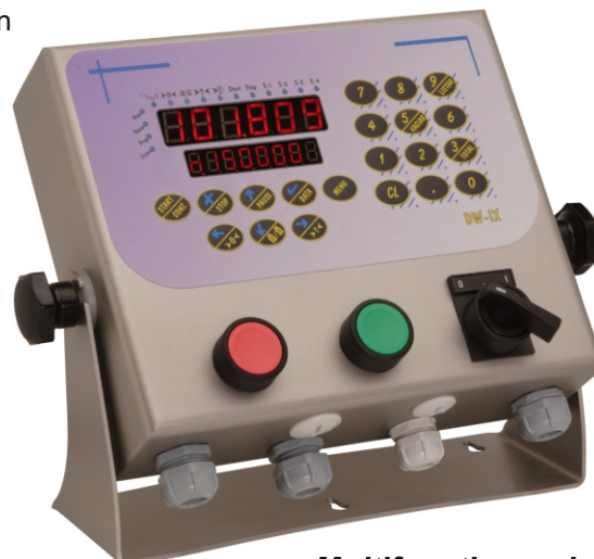
Multifunction weight indicator DW-IX