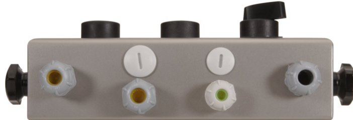
DW-IX Rear view